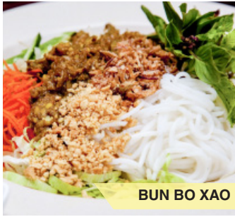
BUN BO XAO