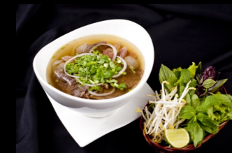
Pho Bo - Vietnamese Beef Noodle Soup Normal $18 Special $22