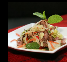
Grilled Beef Salad $24