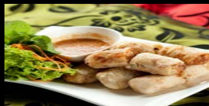
Cha Gio - Vietnamese Spring Roll $15