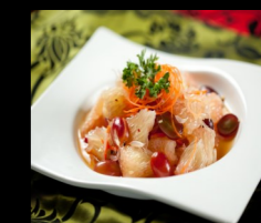
Pomelo Salad $16 add Prawns +$8