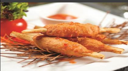
Chao Tom - Prawn on Sugarcane $16