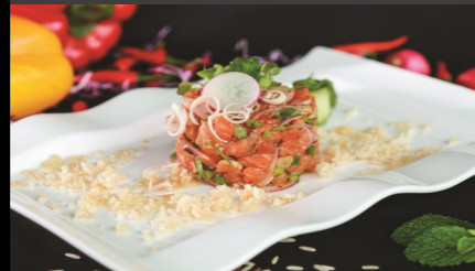
Larb Salmon - Tossed in Lemon jus $29