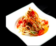
Laotian Green Papaya Salad $16 add Prawns +$8

Price is subject to additional 10% service charge & prevailing taxes