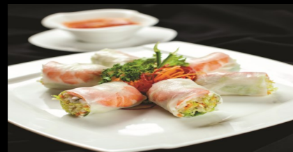
Goi Cuon - Rice Paper Prawn Roll $14