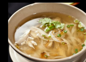
Pho Ga - Vietnamese Chicken Noodle Soup $18